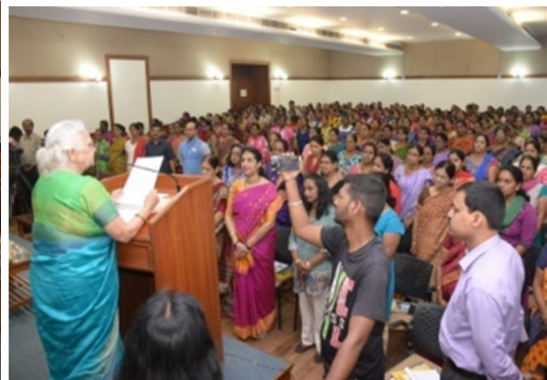
Hon'ble Governor Dr. (Smt) Mridula Sinha addressing the gathering.