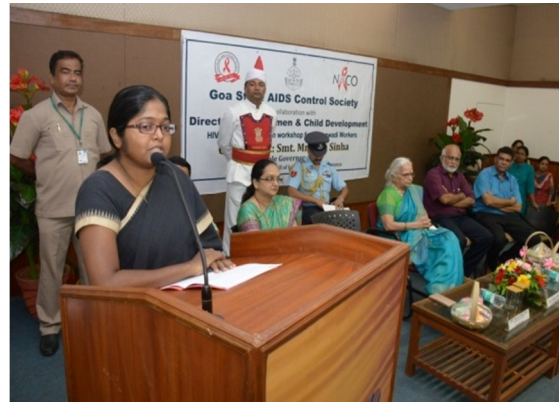
Smt. Shilpa Shinde, IAS

Speaking on the occasion Director of Women and Child Development, Smt. Shilpa Shinde, IAS said that the Anganwadi workers have proved that they are the best means of communication to spread out information of various schemes implemented by the Government for the welfare of the people especially among women in village. The Anganwadi workers being the front line workers in the community are one of the most important groups for prevention and uptake of services. They can even play a crucial role in reducing stigma and discrimination towards people living with HIV, she added.