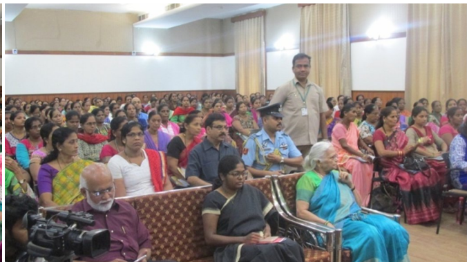
View of the audience