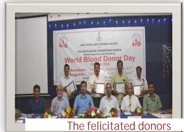
The felicitated donors

A long discussion format show on Blood safety was hosted on Doordarshan and All India Radio .