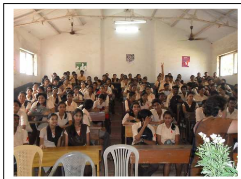
Students of MES HSS, Zuari Nagar at the inauguration of RRC.