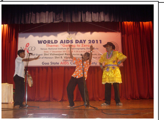
Artists from the various Folk troupe Groups performing at the World AIDS Day, 2011