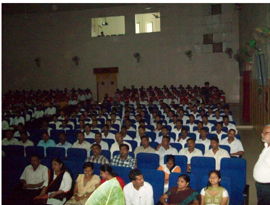
Army personnel attending the advocacy workshop