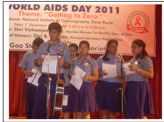
A song composed on HIV/AIDS is being sung by the students of St. Xavier's Higher Secondary School.