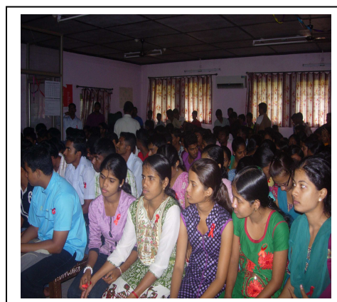
Trainees of ITI, Pernem attending the programme.