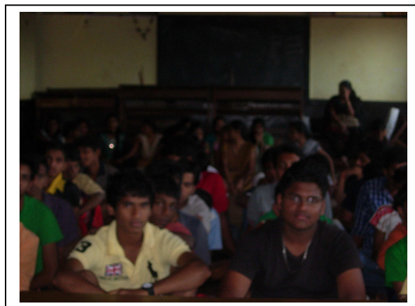
Students seen at the NSS camp attending the programme.