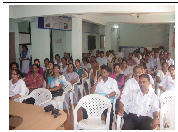
MPH Ws of CHC Ponda attending the training programme.