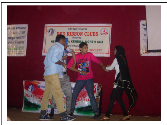
Street Play being performed by Punjab State artists on HIV/AIDS.