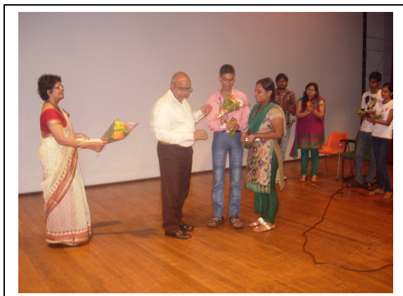
2 nd Prize winners- CES College, Cuncolim