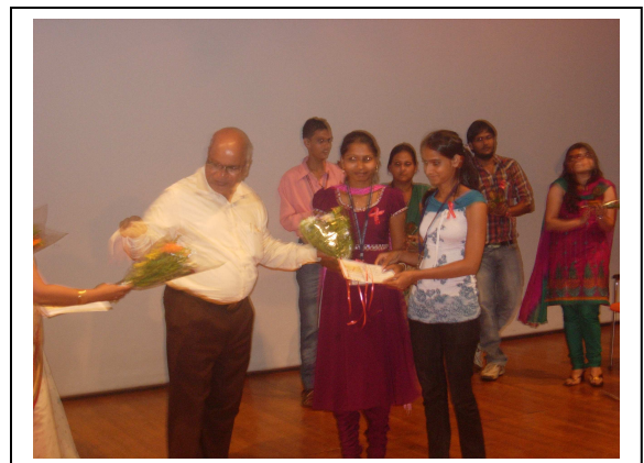
3 rd Prize winners – St. Xavier's College, Mapusa