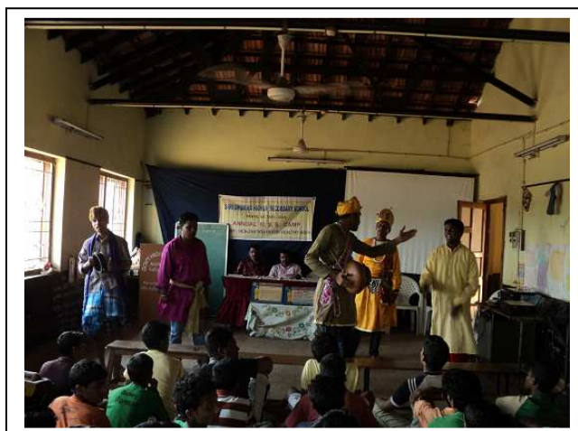
Folk troupe performance by Kala Chetna Group, Volvoi at Government High School, Morlem