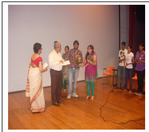
1 st Prize winners - Goa Medical College, Bambolim