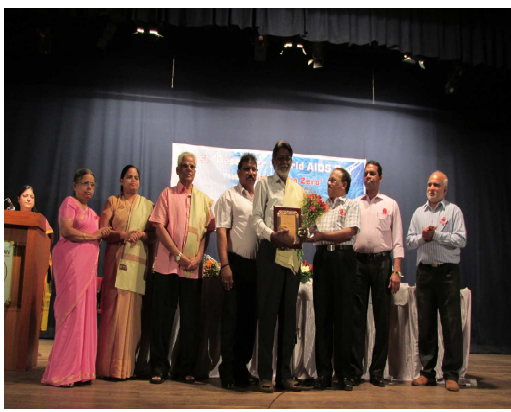
Shri Suresh Thakur, President of Motor Cycle Pilot Association being felicitated by Hon'ble Minister for Health