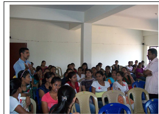
Students of Vrundavan Institute attending the interactive session