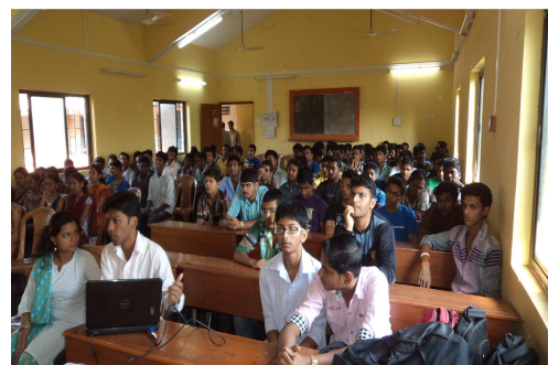
Students of Government Polytechnic attending the RRC Program