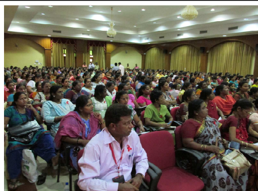
Anganwadi Workers seen during the workshop on World AIDS Day