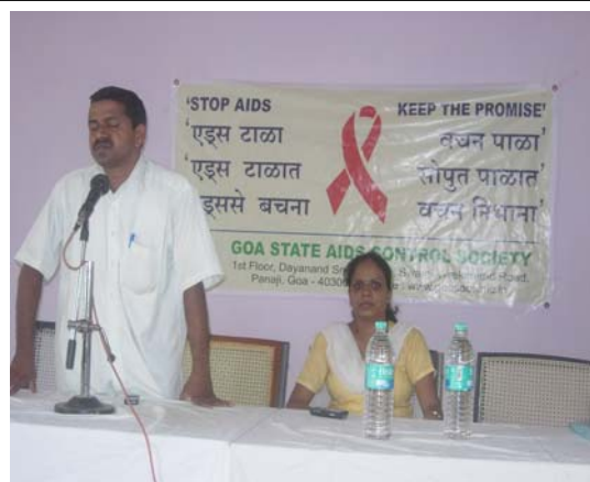
DD (IEC) taking the session