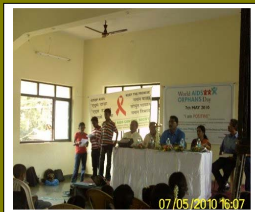
Children performing during the event