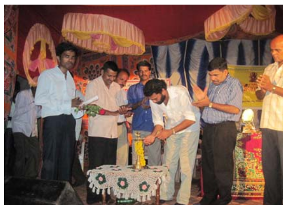
Inauguration of RRC at Pernem