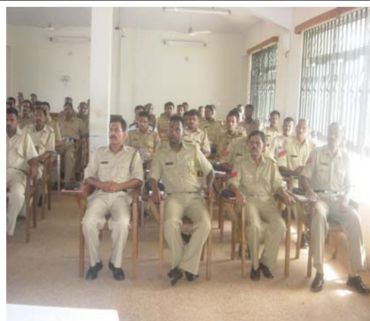
Police personnel attending the training