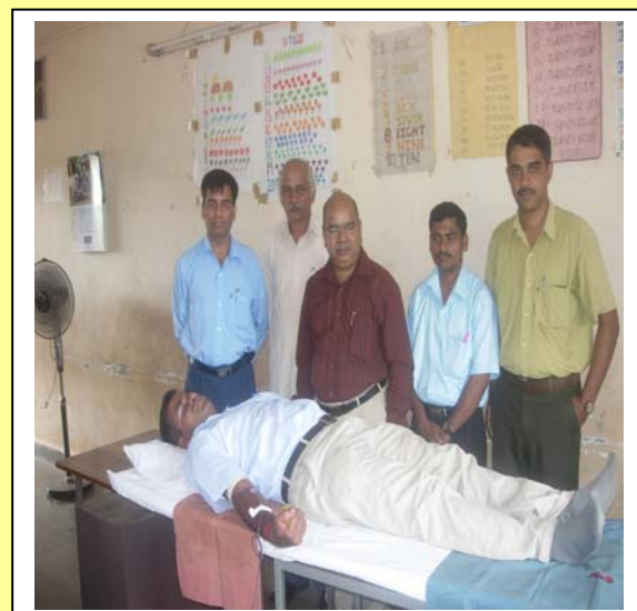
Project director, Goa SACS present during Blood Donation Camp at Nevra