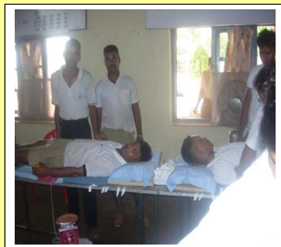
Blood Donation Camp at 5 TTR, Bambolim