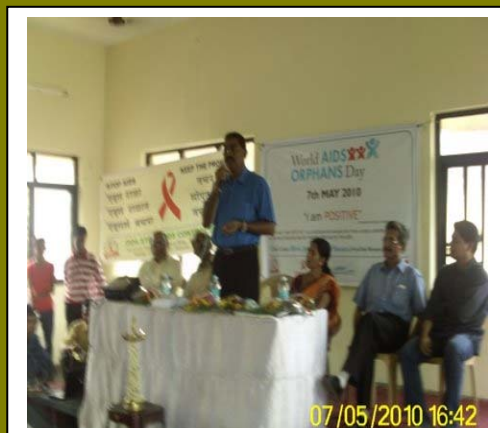
Revenue Minister addressing the children