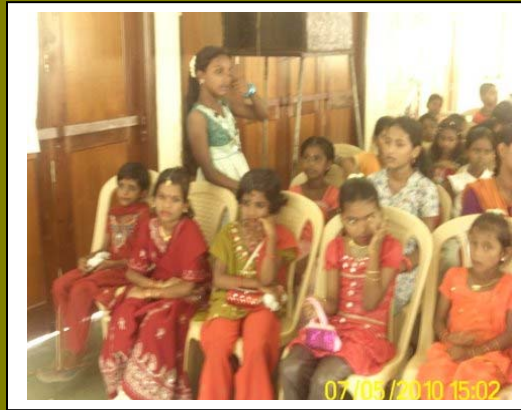
Children attending the programme