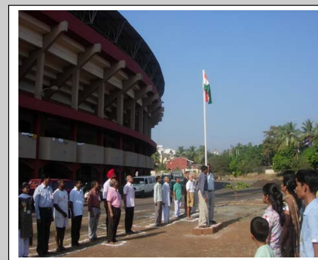
Project Director initiating the National Integration Youth Camp