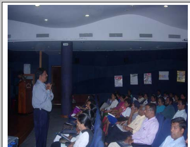
Resource person taking the session