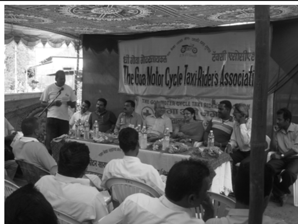
Motorcycle & Taxi riders sharing their experiences