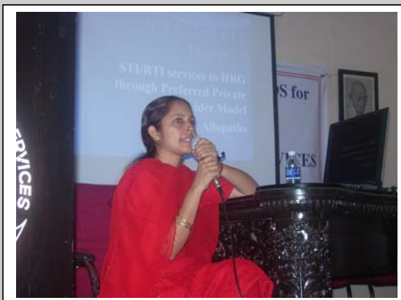
DD, STI (Goa SACS) taking the session