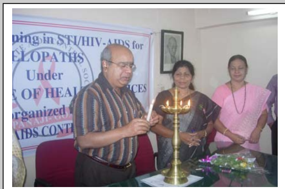
Project Director inaugurating the workshop