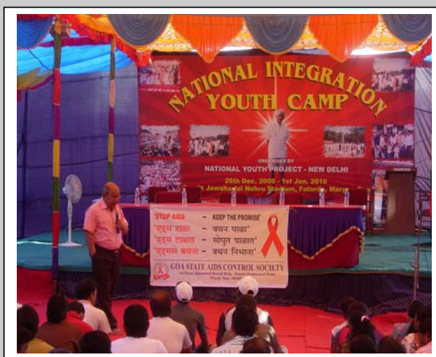
Project Director Goa SACS addressing the camp