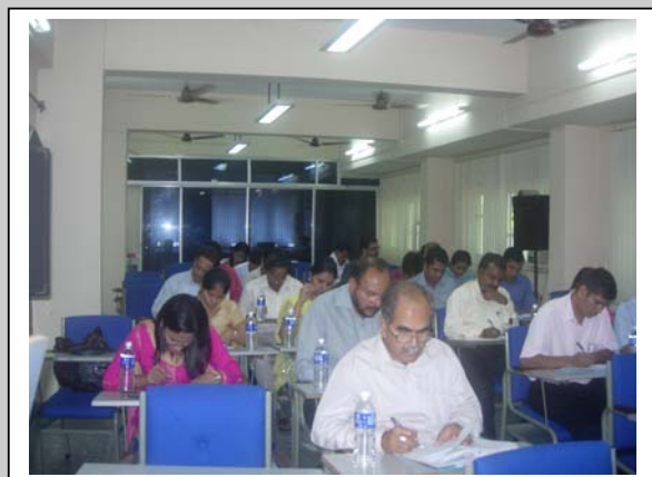
Medical Officers attending the workshop