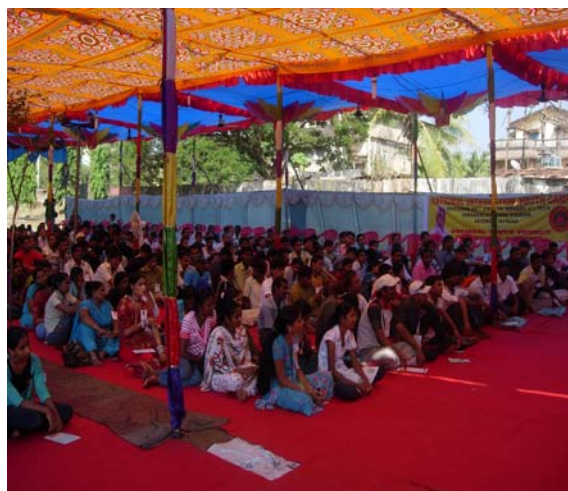
Youth participating in the camp