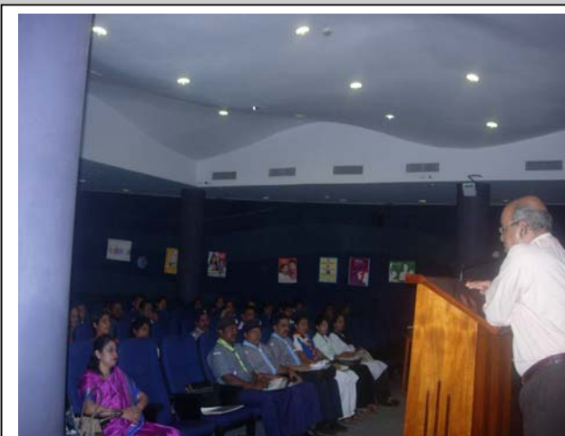
Project Director Goa SACS addressing in the workshop