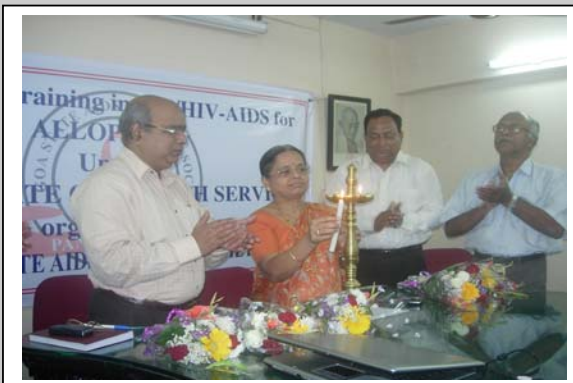
Director, DHS inaugurating the workshop