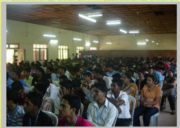
A view of the audience who attended the function of Voluntary Blood Donation Day held at ITI Borda, Margao.