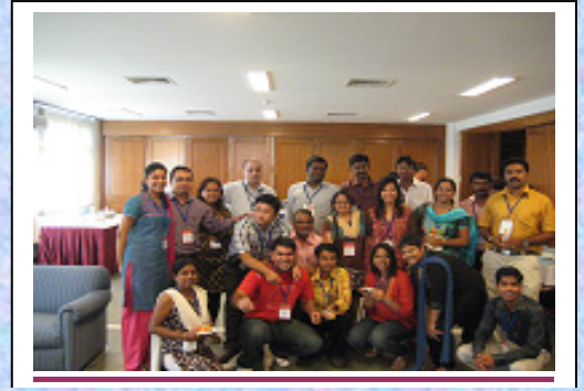
IEC officers and Consultants (YA) of all SACS participating in the review meeting.