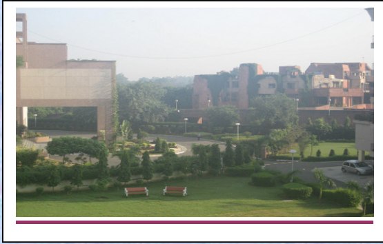
Location of the Review meeting at NACO, New Delhi