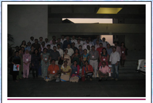
Group photograph of IEC officers/ Consultant (YA) with NACO officials