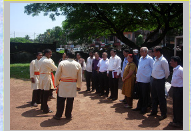
Volunteers enacting a Street play on the occasion of Voluntary Blood Donation Day at ITI Borda, Margao.