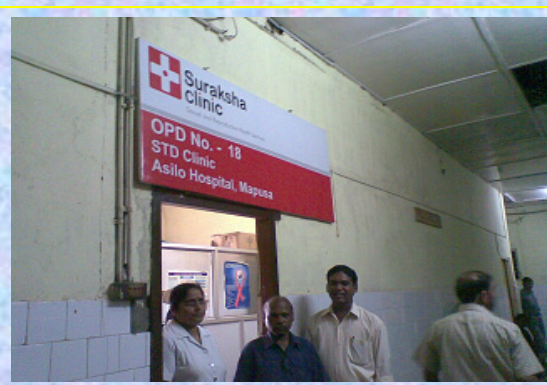
Suraksha Clinic at Asilo Hospital, Mapusa