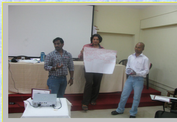
Group work presentation