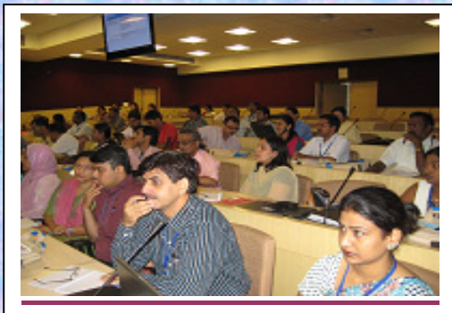
IEC officers and Consultant (YA) of all SACS who participated in the review meeting.