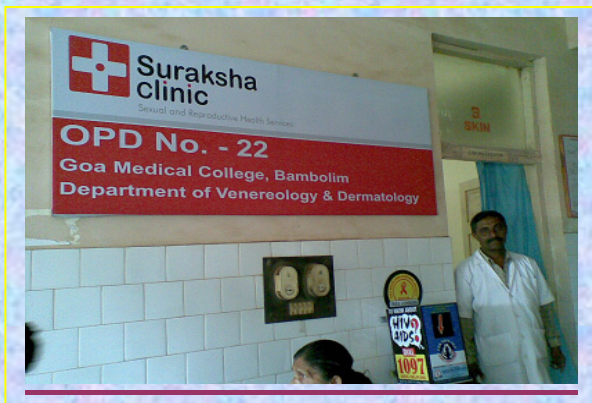
Suraksha Clinic at GMC, Bambolim

As per NACO guidelines, the designated STI/RTI clinics are to be branded as SURAKSHA clinics so as to increase the awareness of the facilities available among the general public. The same has been done at clinics situated at Goa Medical College Bambolim, Asilo Hospital, Mapusa and Hospicio Hospital Margao.