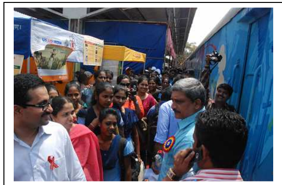
Hon. Chief Minister, Shri Manohar Parrikar, Shri Prasanna Acharya, Additional Collector interacting with the visitors at RRE inaugural function