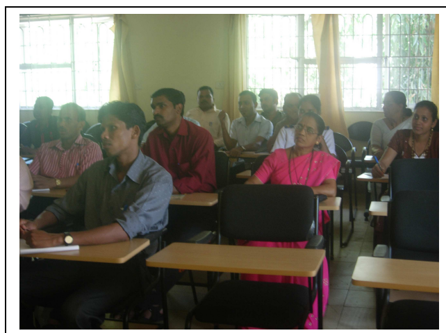
Staff of CHC, Canacona attending the sensitization programme