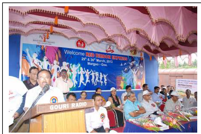
Hon. Health Minister, Shri Laxmikant Parsekar addressing the gathering during the inaugural function of RRE