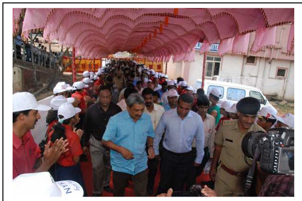
Hon. Chief Minister, Shri Manohar Parrikar being escorted for the inaugural function of RRE