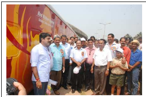
Hon. Chief Minister, Shri Manohar Parrikar and Hon. Health Minister, Shri Laxmikant Parsekar are seen with the other dignitaries present on the occasion of inauguration of RRE