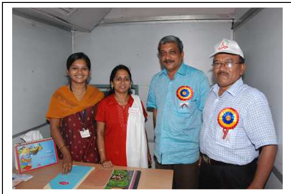
Hon. Chief Minister, Shri Manohar Parrikar and Hon. Health Minister, Shri Laxmikant Parsekar are seen with the ICTC counselors on board the RRE