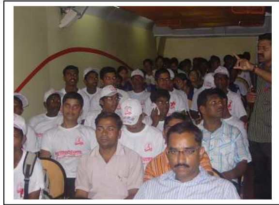
Nehru Yuva Kendra Volunteers attending training session in the training coach of RRE