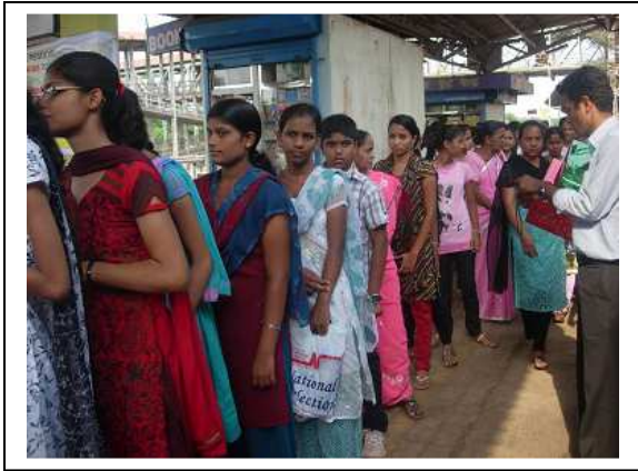
General public at the venue of the RRE