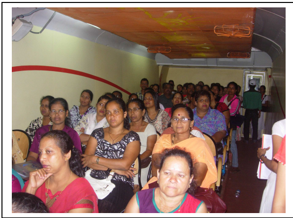
The Anganwadi Workers attending the training session in one of the coaches of RRE