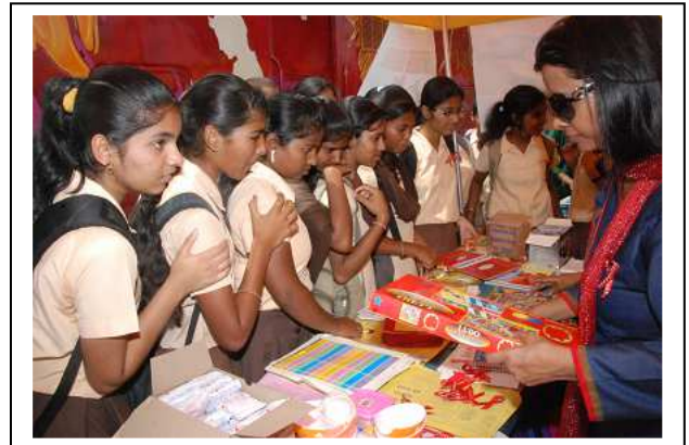
Students interacting with the volunteers of NGOs at RRE venue