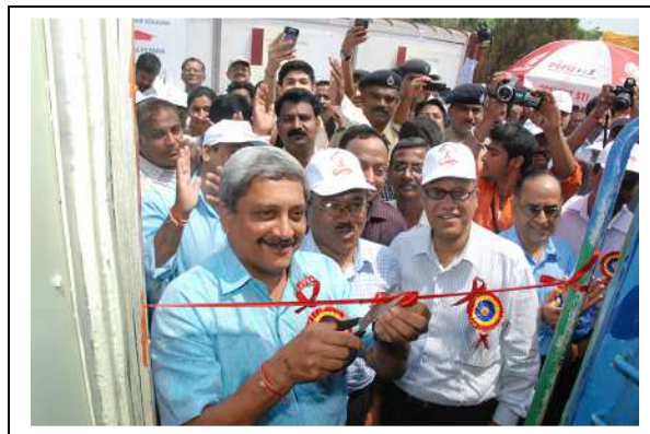
Hon. Chief Minister, Shri Manohar Parrikar inaugurating the RRE