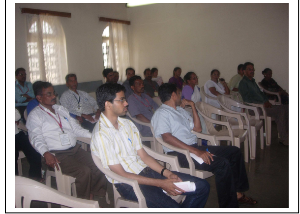
Staff of PHC, Cansarvorne attending the sensitization programme