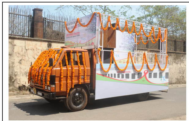
The Red Ribbon Express IEC van