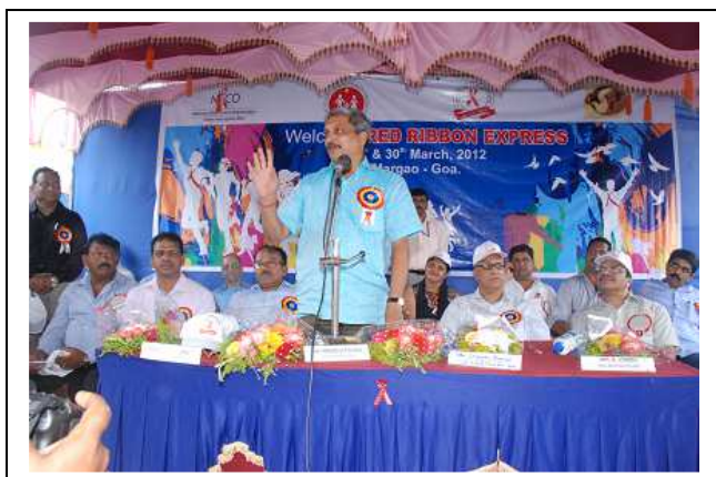
Hon. Chief Minister, Shri Manohar Parrikar addressing the gathering during the inaugural function of RRE