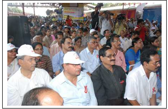
People present for the inaugural function of RRE at the Railway Station, Margao