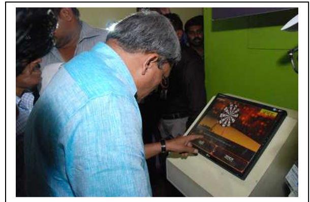
Hon. Chief Minister, Shri Manohar Parrikar is seen attempting to answer the questions on HIV/AIDS displayed on the screen.