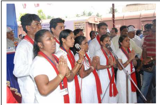
Welcome song being performed by a group of volunteers from NGO, Zindagi-Goa