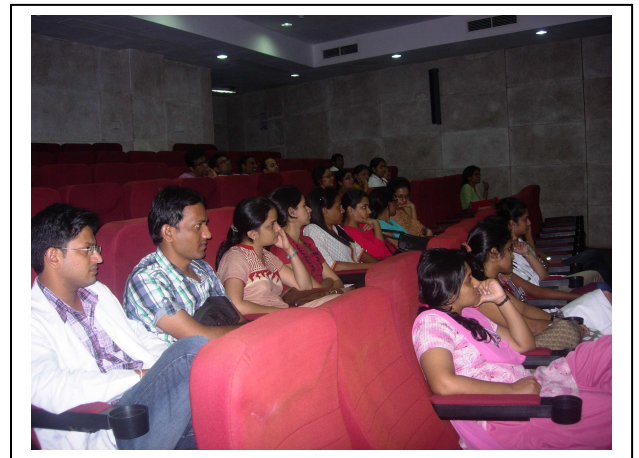
Participants for the programme.