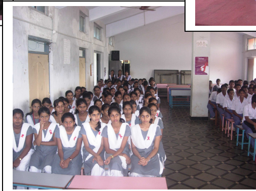
11 th Std. Students attending the programme.