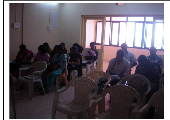
Lab. technicians attending the refresher training.