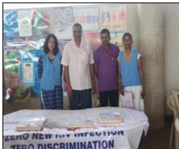
DD(IEC) & AD( Mainstreaming) along with other stakeholders at GSACS Stall at the convention